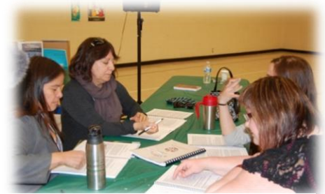
Participants from 4th Regional Treaty Education workshop – Sagkeeng First Nation

As exact locations are confirmed our website will be updated. For more information and a complete schedule of training sessions please continue to visit our website at www.trcm.ca .