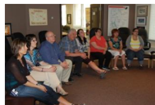
Participants from Louis Riel SD @ TRCM learning Centre

Please continue to visit the TRCM website at www.trcm.ca ; Future TEI training opportunities will be posted under the TEI tab.