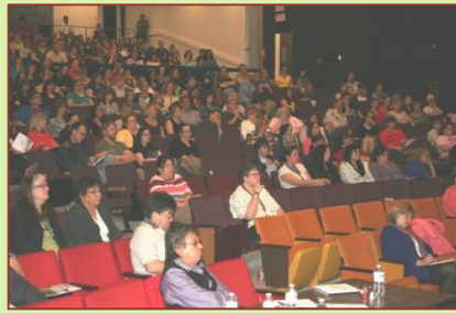
Staff from School District of Mystery Lake