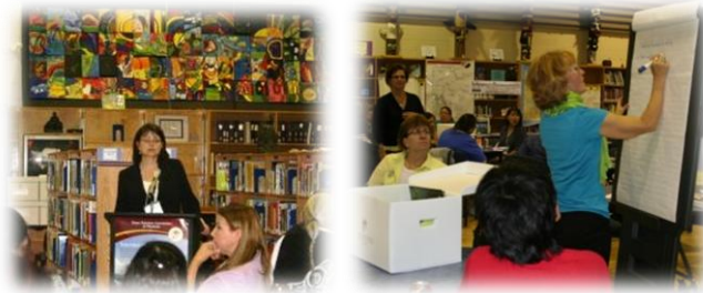
Participants at the 1 st Regional Treaty Education Catalyst Training Session

All of the Treaty Education Teacher Guides feature Treaty education themes, sub-themes, topics which are linked to the existing Manitoba curriculum. The guides include eight lesson plans with supporting background reading information for the Teacher and Black Line Masters for implementation of the lesson plans.